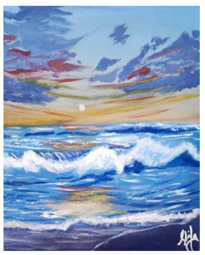
Haram Akeel - 4T