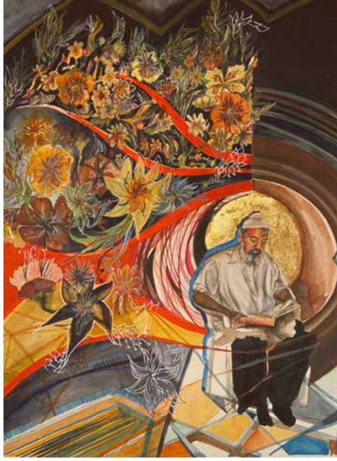
Salwa Hussain - 4 A2