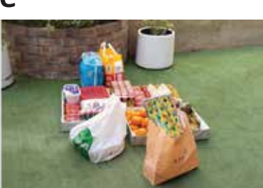
and capacity building. With coordinated monthly charitable activities, we anticipate significant expansion and success for Charahgar, resulting in a positive impact on the lives of those we serve.

Charahgar strives to extend its influence throughout the city, encouraging a long-lasting shift in the mindset of the youth to prioritise responsibilities above rights. We provide support to both disadvantaged and privileged members of society through material assistance, kindness, emotional support,