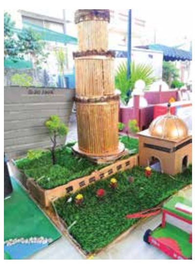
students' creative and innovative thinking. It was a testament to their resourcefulness and dedication to making a positive impact on the environment.

An Upcycling Exhibition was organised to showcase their creativity and environmental awareness. This exhibition not only promoted sustainable practices but also nurtured