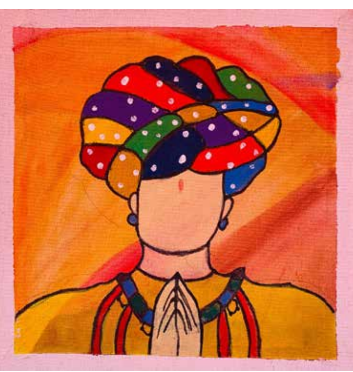
Mishaal Fatima - 8T