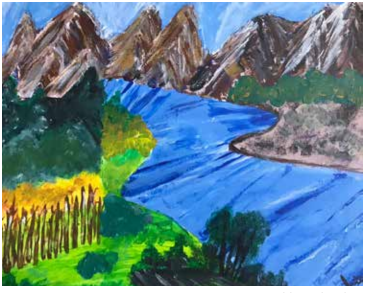
Zanishba Behzad - 9