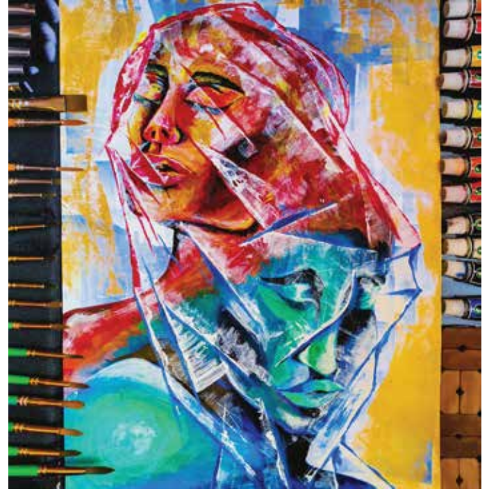
Ahmed Hussain - A Level