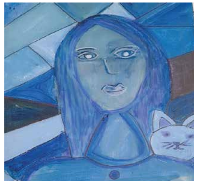
Zinnia Azeem, Class 5-E